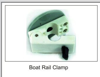
Boat Rail Clamp